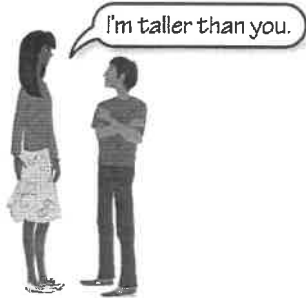
She's taller than him.