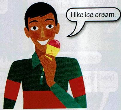
He's eating an ice cream. He likes ice cream.

They read / he likes / I work etc. = the present simple :